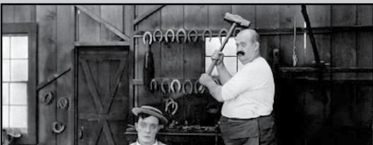
The Blacksmith (1922) – Buster Keaton

The Plaza Cinema & Media Arts Center 20 Terry Street | Patchogue, NY 11772 (631) 438-0083 | www.plazamac.org