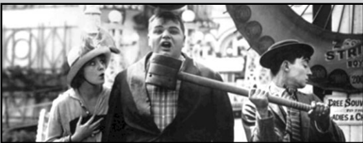
Coney Island (1917) – Buster Keaton